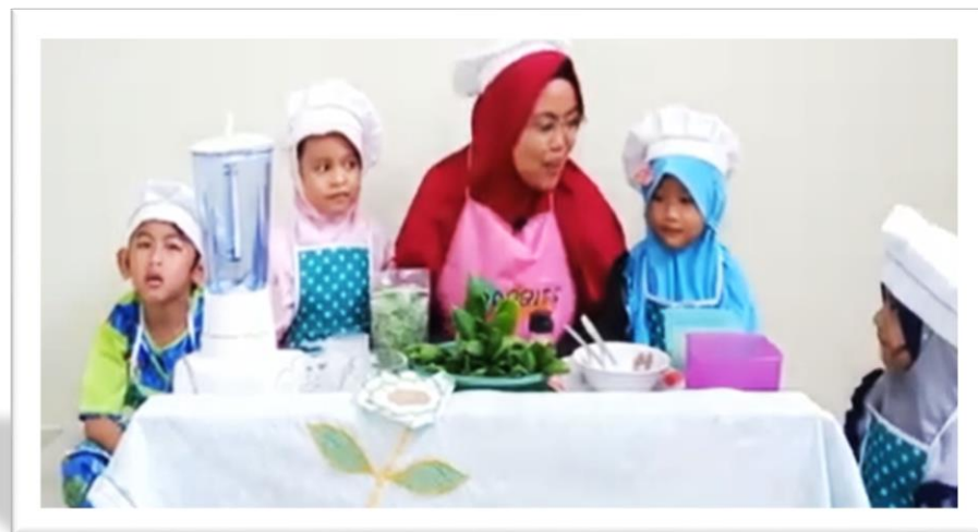
Figure 1. Implementation of Fun Cooking

The recipes for the food served are taken from "cooking" cookbooks which are accompanied by processing methods and the benefits of the ingredients used. Like the book "Cooking is Easy Cooking Without Fire", the recipe book "Cooking Is Fun" So that fun cooking activities carried out by children and parents at home are not only making and serving good and interesting food but also healthy for health. Fun activities for children will make it easier for children to remember things.