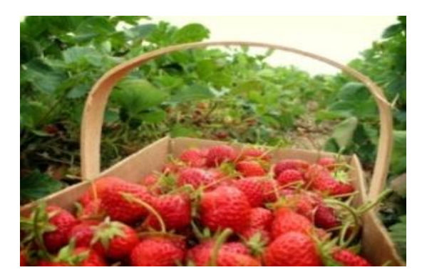
Figure 3. Geoculinary in the district Sembalun 2. Geotourism

Geoculinary is the potential of the local culinary named in connection with the terms of geology and geopark Rinjani. Potential Sembalun geokuliner district, East Lombok based on the recommendation of UNESCO is in the village of Lawang Sembalun