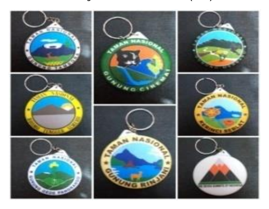
Figure 2. Geosuvenir in the district