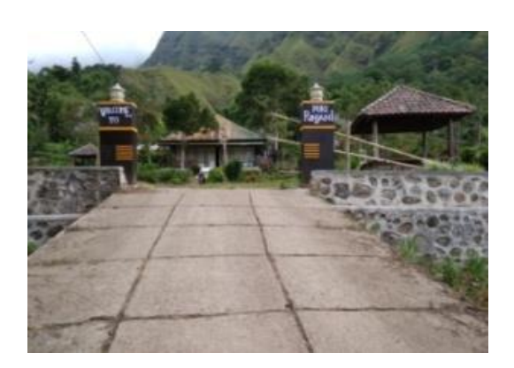
Figure 5. Geohomestay in the district Sembalun