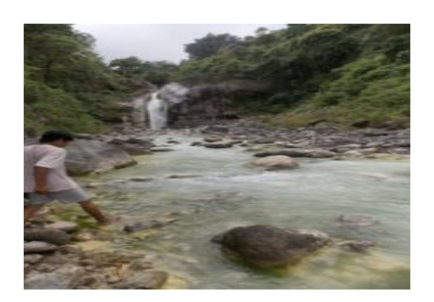
Figure 4. Geotourism in the district Sembalun 3. Geohomestay

Geohomestay is houses which functioned as an inn that can be rented by tourists at affordable prices. Equipped with the interior and the information boards on the theme geopark Rinjani in Lombok