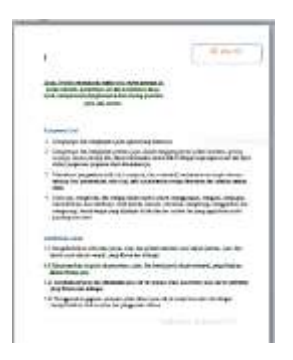
Figure 1. The core competencies and the basic competencies

2017 revision based on the suggestions of material experts. The suggestions submitted by material experts are (1) the depth, breadth and relevance of the material are good. (2) Spelling adapted to the Indonesian spelling system. Based on the assessment and suggestions from the Indonesian language and literary material experts, they revised the teaching material products.