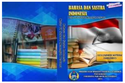
Figure 4. Main cover

are free to find various Thev information as they wish. In adolescence, there is a growing critical thinking, defending arguments according to the way of thinking that is reality, and being responsible based on the experiences they have (Desmita 2016: 108). They are free to find various information as they wish. In adolescence, there is a growing critical thinking, defending arguments according to the way of thinking that is reality, and being responsible based on the experiences they have (Desmita 2016: 108). They are free to find various information as they wish. In adolescence, there is a growing critical thinking, defending arguments according to the way of thinking that is reality, and being responsible based on the experiences they have (Desmita 2016: 108). They are free to find various information as they wish. In adolescence, there is a growing critical thinking, defending arguments according to the way of thinking that is reality, and being responsible based on the experiences they have (Desmita 2016: 108).