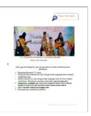
Figure 2. Musicalization of Folklores

Figure 2 shows the errors in writing the word "study and congress" changed to "recite and concrete". Figure 3 is a mistake in writing the word "stage" the correct improvement is "staged". The validation results based on suggestions from the material experts showed that 98% percentage was declared valid. Suggestions and criticisms from the material experts were used to correct the errors in developing the Indonesian language and literature.