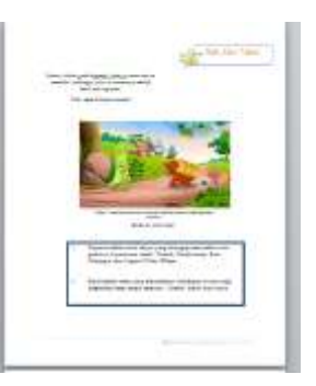
Figure 7. Let's find out

Figure 6 uses a column grip layout. In this layout is dominated by writing. The table of contents presents a source of information about the material to be studied and displays the page. It aims to make it easier to find information that is desired and motivated to learn. The type of letters in the ITC Christian title and the size of the letter 36, while the writing of the sub-section uses the times roman font and font size 14. The color tone selection in the table of contents is more dominant in blue.