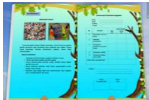
Figure 8. Workshop page and Activity Assessment Instrument

The craft page contains activities to make students more active and train students' skills. While the assessment sheet is an assessment of the work of students.