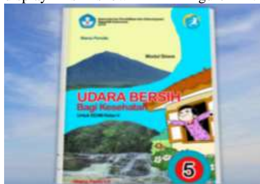
Figure 1. Front cover