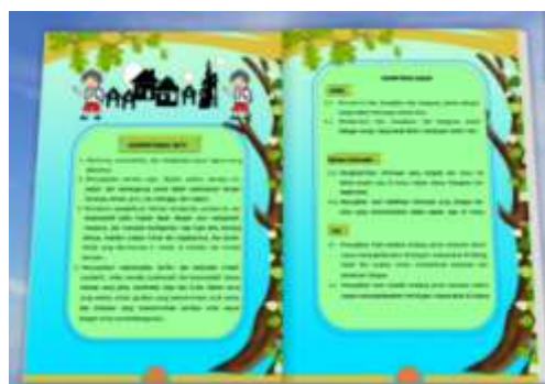
Figure 2. Core Competency and Basic Competency Pages

The core competency page consists of, spiritual competence (KI 1), social competence (KI 2), knowledge competency (KI 3) and skills competency (KI 4). While basic competencies are the development of core competencies. Each subject contains different basic competencies.