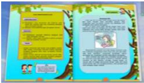
Figure 3. Indicator Pages and Learning Objectives