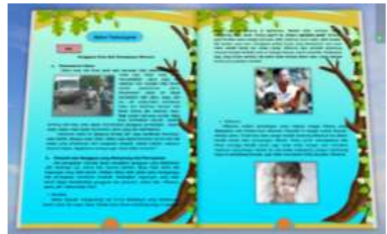
Figure 6. Material page