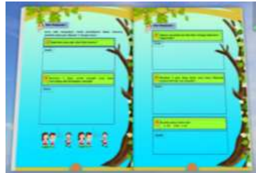
Figure 7. Training Problem Page

The question page contains practice questions from the previous learning material.