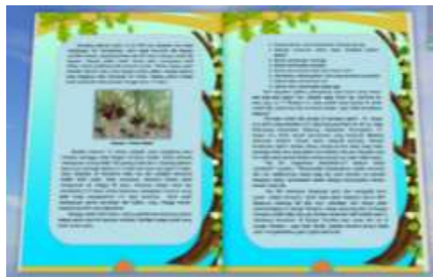
Figure 4. Story page

The story page contains stories of local wisdom found in Jambi province.