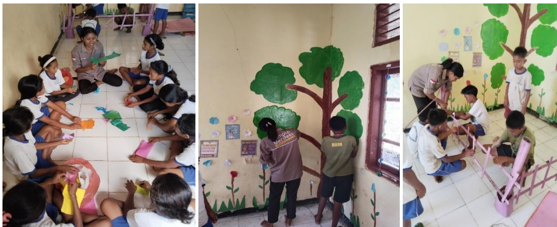
Figure 2. Creating a Reading Corner