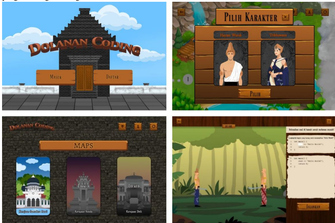
Figure 2. Platform Interface

the play area. Each of these pages is designed with the objective of creating an intuitive user experience while supporting an interactive programming learning process. The design ensures seamless integration between the pages, offering users an easy and responsive navigation system to enhance the overall learning experience. The interconnectedness of these elements fosters a user-friendly interface that facilitates the engagement and progression of students in their programming learning.