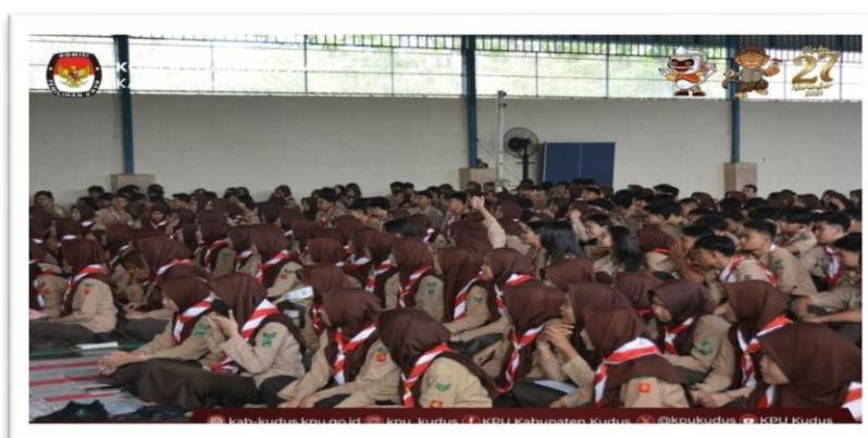
Picture. 1 Documentation of the Implementation of the Socialization Seminar by the Kudus General Election Commissions (KPU).

A social problem that continues to mushroom due to the irrationality of voters has created an urgency for academics and the wider community to provide stimulus in solving problems. In the socialization carried out verbally by the Kudus General Election Commissions , the students' enthusiasm for the activities was high as evidenced by the large number of participants. students who took part with more than 300 participants attending. Students who have reached adulthood will always remember how important information related to general elections is, the benefits felt by students first, knowledge related to the importance of choosing rationally and intelligently, second, experience in digging up information related to the axis of democracy, third, practice and The experience gained will be able to be conveyed to a wide audience. Fourth, students are able to choose preferentially to see the track record of candidates at school or the election of student council leaders at SMA 2 Bae.