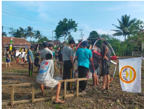
Figure 2. Mutual Cooperation ( Gotong-Royong ) of Ikatan Muli-Mekhanai Kemandakan Pekon Kedaloman (Local youth association).

Gotong-royong essentially aims to increase public awareness of environmental problems and community problems, and find solutions, as well as the basis for fully conscious and active individual participation in solidarity protection, wise, and rational use of the community, potential ideas/communities (Adha et al. , 2019).