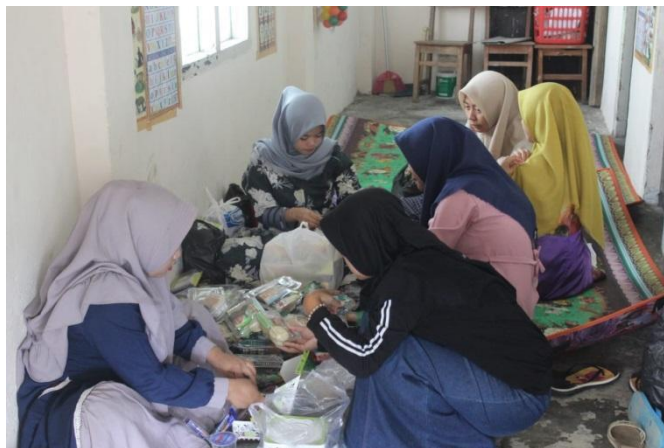
Figure 3. Muli-Mekhanai (Youth Citizens) preparation for sharing Takjil (Snack).

The Engagement of youth citizens of Kedaloman as a form of Sakai Sambayan implementation is seen in religious activities, where youth citizens of Kedaloman jointly clean the mosque environment to welcome the month of Ramadan, and mutual cooperation ( gotong-royong ) activities are also seen in the process of preparing places of worship for the holidays. Sakai Sambayan serves as the basis for the life of youth citizens of Kedaloman village, which is internalized through religious activities. It shapes the character of youth who help each other and shape the character of religious youth under the function of local wisdom, namely a means of improving human quality and activities that can support the development (Unayah & Sabarisman, 2016). The character can be seen from various processes, such as cooperation in preparing takjil (snack) [Figure 3] and active participation in religious activities during the Prophet Muhammad SAW (Maulid Nabi Muhammad SAW) birthday commemoration.