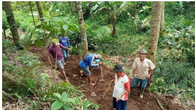
Figure 1. Mutual Cooperation/ Gotong Royong and Togetherness in Building Roads.

Life principles of Sakai Sambayan show a high sense of participation and solidarity in various social activities, whereas the people of Lampung have a culture of shame if they cannot be involved in community activities (Ariyani et al. , 2014). Social activities among the citizen of Kedaloman village can be seen and manifested in various actions, such as community service by repairing and protecting the surrounding environment and humanitarian activities by helping each other.