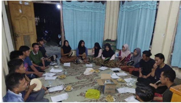
Figure 4. The youth citizen of Kedaloman practices Bubalah and Ketipung through the Ikatan Muli-Mekhanai Kemandakan Pekon Kedaloman .