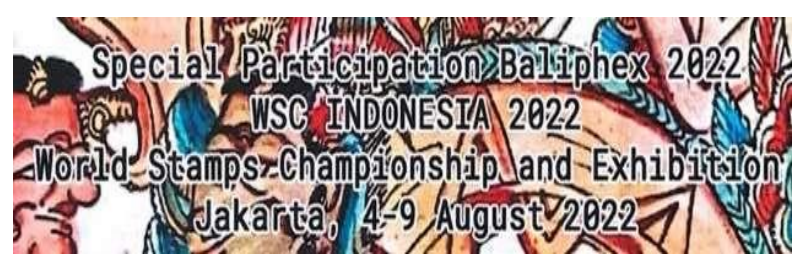
Picture 10. Baliphex 2022 event description text

The focus of the image above is the silhouette of the temple which is given a black color which is the denotative marker. By denotative sign, it gives the meaning that the temple is a place of worship for Hinduism and can be found in Bali. In denotative sign is a picture of a temple which is a place of worship for Hinduism in Bali. As a connotative marker, Pura becomes iconic and well-known locally and even internationally. Apart from being a place of worship, the temple is a Hindu religious tourist destination. In a connotative sense, PD PFI Bali wants to show pseudo-pride as a Balinese because it has an iconic place like this temple. In a connotative sense, the message that can be taken from the picture of the temple is the promotion of the island of Bali as a tourist destination having an icon of a place of worship for Hindu beliefs.