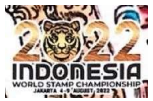
Picture8. WSE Baliphex 2022 logo in PRISMA

The PRISMA Series Road to Baliphex 2022 as produced by PD PFI and PT Pos Indonesia is trying to be used as a promotional tool for the Baliphex 2022 event in Jakarta. This finding is based on the signs we found and an analysis of their meanings in denotation and connotation as set out below: