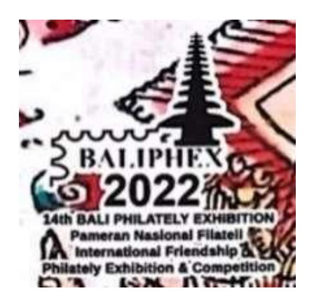
Picture 9. Baliphex 2022 logo in PRISMA

Denotatively, the logo for the exhibition has a tiger image with a striking golden yellow color which represents the mascot symbol of the 2022 WSCE Indonesia event which will be held on 4-9 August 2022 at JIEXPO Kemayoran. In the next stage, connotatively the tiger marker has the meaning of an animal that has power in its habitat in the forest, so that it represents a meaningful sign of celebrating victory in the 2022 WSCE Indonesia event.