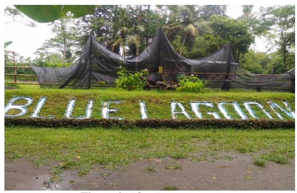
Figure 2. Blue Lagoon