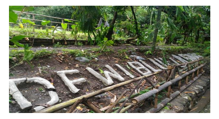
Figure 3. The Symbolic of Nyai Sekar Arum

Furthermore, the name of the Padukuhan Ndalem has its own tale by the local community. The village has a historical relationship with the ancient Mataram kingdom,