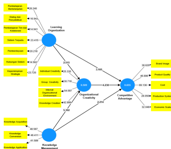
Figure 2. Hypothesis Testing