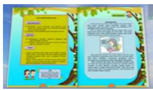
Figure 3. Indicator Pages and Learning Objectives