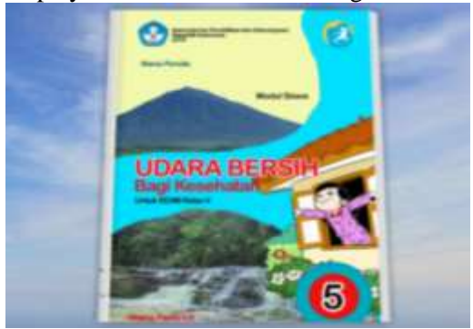
Figure 1. Front cover