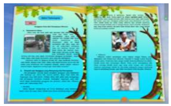
Figure 6. Material page

The learning material page contains learning material that is inserted in the story that has been presented.