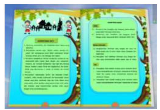
Figure 2. Core Competency and Basic Competency Pages

The core competency page consists of, spiritual competence (KI 1), social competence (KI 2), knowledge competency (KI 3) and skills competency (KI 4). While basic competencies are the development of core competencies. Each subject contains different basic competencies.