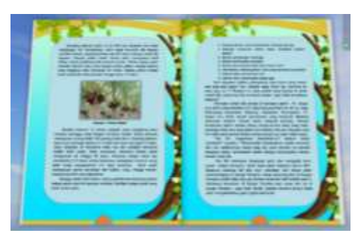
Figure 4. Story page

The story page contains stories of local wisdom found in Jambi province.