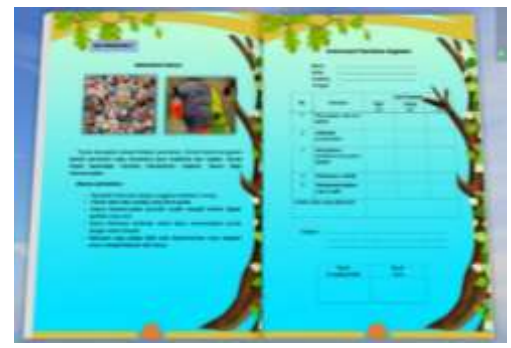
Figure 8. Workshop page and Activity Assessment Instrument

The craft page contains activities to make students more active and train students' skills. While the assessment sheet is an assessment of the work of students.