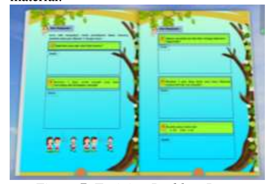
Figure 7. Training Problem Page

The question page contains practice questions from the previous learning material.