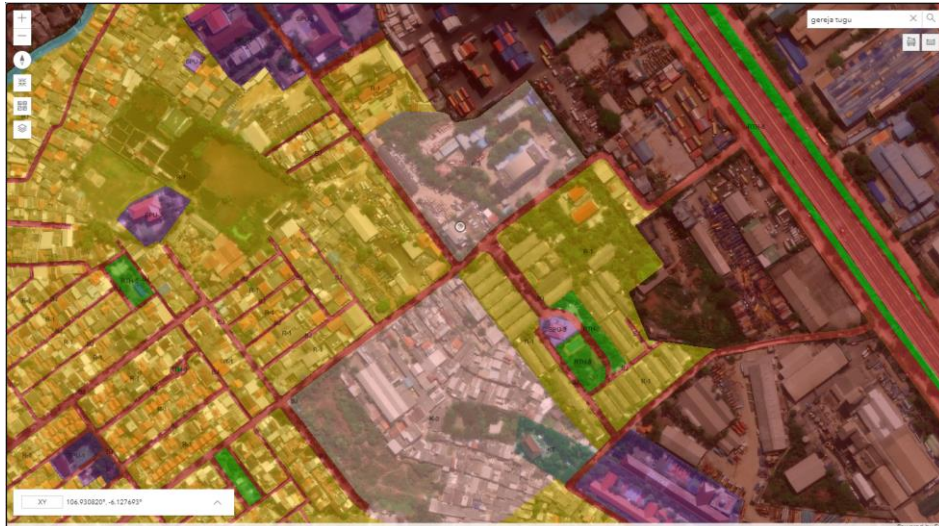
Image 1. Kampung Tugu according to the RDTR website.